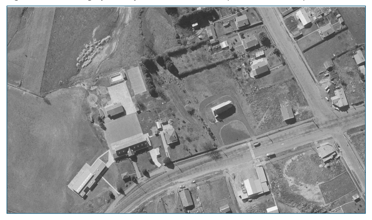
Figure 2: Aerial imagery of subject site taken in 1961 (source: Retrolens)

Figure 1: Aerial image of subject site taken in 1943 (source: Retrolens)