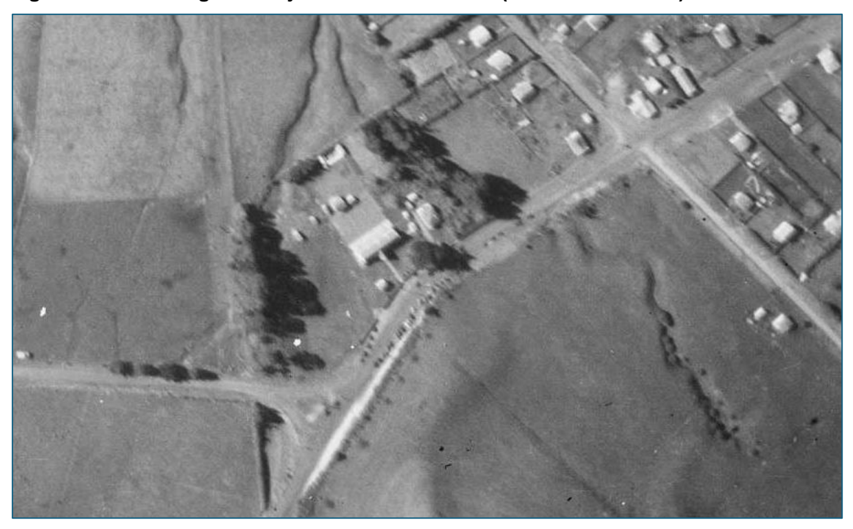
Figure 1: Aerial image of subject site taken in 1943