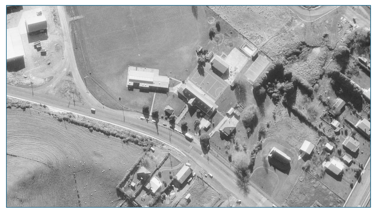
Figure 4: Aerial image of subject site in 1978